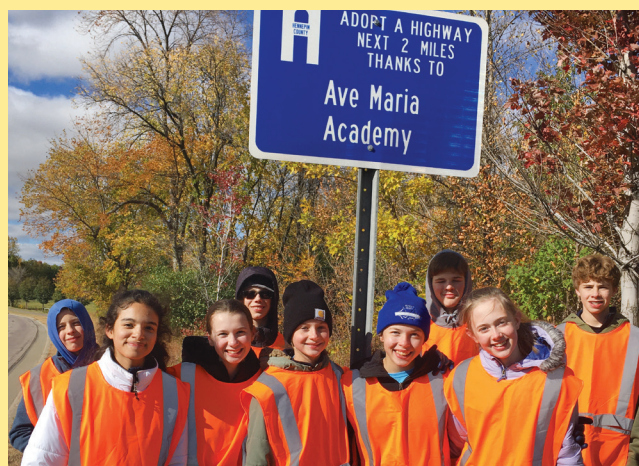
Students participating in the Adopt A Highway program