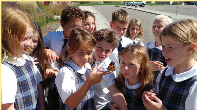
The 3rd grade class studying the life cycle of the butterfly